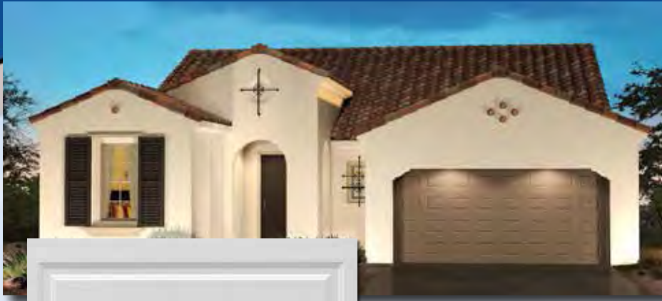
Model 625 Short Panel