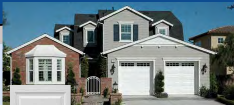
Model 224 Long Panel with Optional Windows