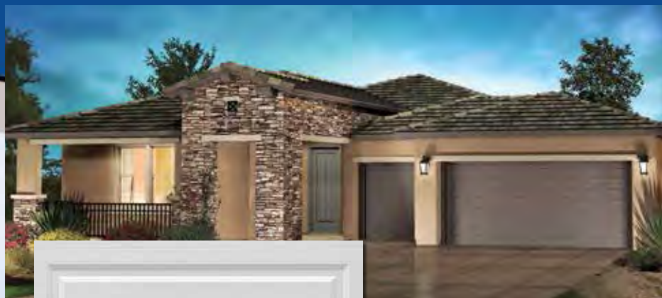
Model 225 Short Panel