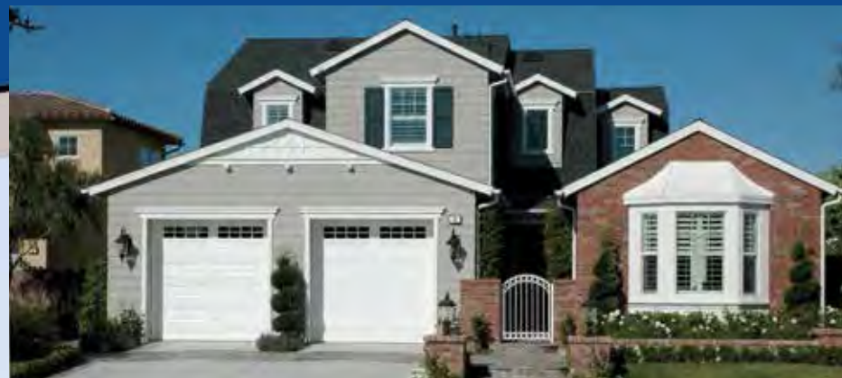
Model 224 Long Panel with Optional Windows

For strength and longevity, the Model 224 utilizes heavy 24-gauge steel without sacrificing beauty. The exterior of the door is embossed with a woodgrain texture finish accented by a raised panel design. The door is composed of 24 gauge (.023) hot dipped galvanized steel with baked-on polyester paint and reinforced rail for strength and safety.