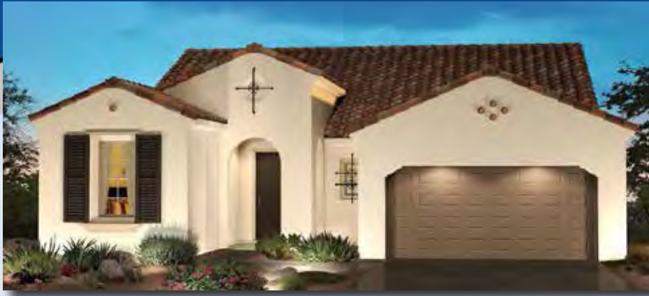
Model 625 Short Panel

The Model 625 is a thermally efficient steel front and steel backed "sandwich style" door. Formed with a unique sculpted raised panel the Model 625 is embossed with a natural wood grain texture. The core is CFC free Polystyrene insulation with a steel back skin for thermal efficiency. The Model 625 door will add great value and beauty to any home.