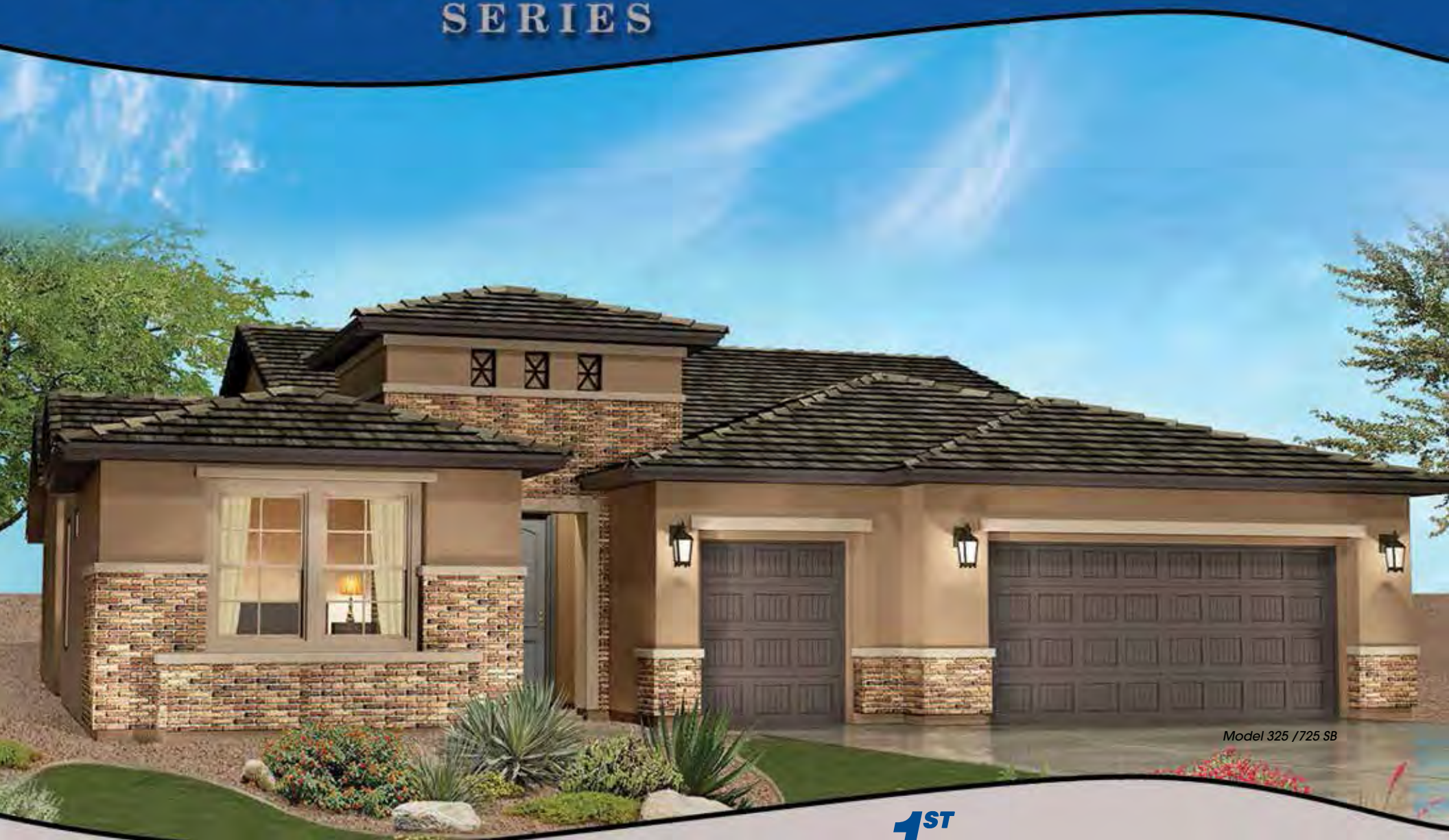
Model 325 / 725 SB