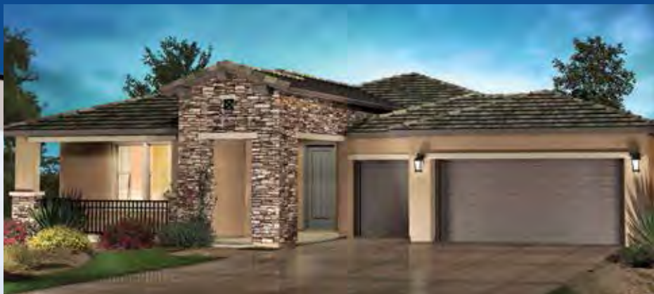
Model 225 Short Panel

The cost effective Model 225 offers exceptional value. The exterior of the door is embossed with a woodgrain texture finish accented by an elegant raised panel design. The door is composed of 25 gauge (.019) hot dipped galvanized steel with baked-on polyester paint and reinforced rail for strength and safety.