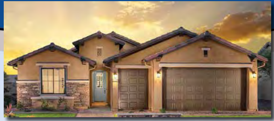
Model 325 Short Panel

The Model 325/725 has a unique bead board raised panel, the Model 325/725 is embossed with a natural wood grain texture raised panel with recessed vertical grooves and a baked-on polyester finish. The Model 325/725 will give your home the appearance of having custom wood carriage house doors with the durability and longevity of steel and minimum maintenance.