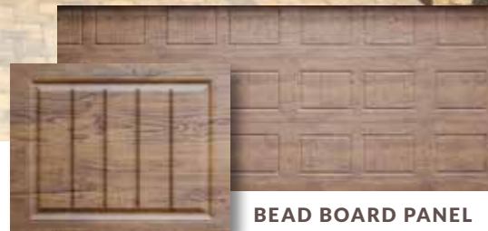
BEAD BOARD PANEL