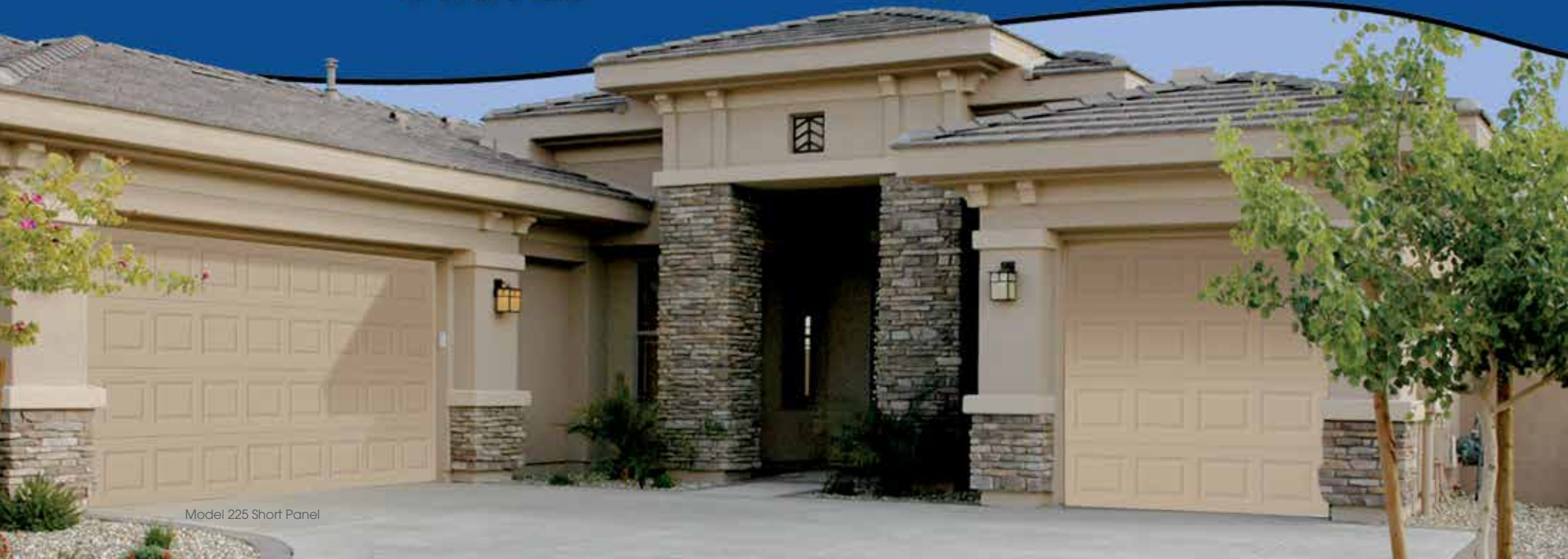
Model 225 Short Panel

1 ST UDT 1 ST UNITED DOOR TECHNOLOGIES www.firstudt.com