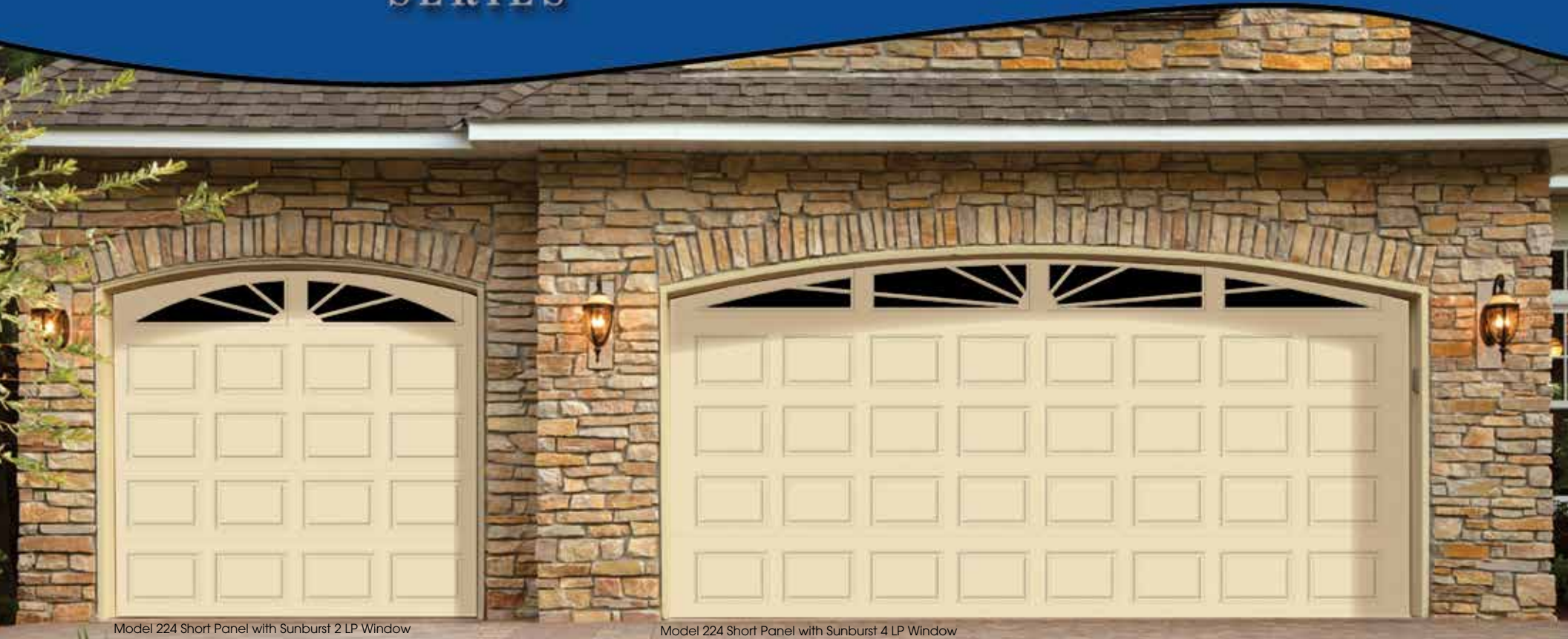
Model 224 Short Panel with Sunburst 2 LP Window

1 ST UDT 1 ST UNITED DOOR TECHNOLOGIES www.firstudt.com